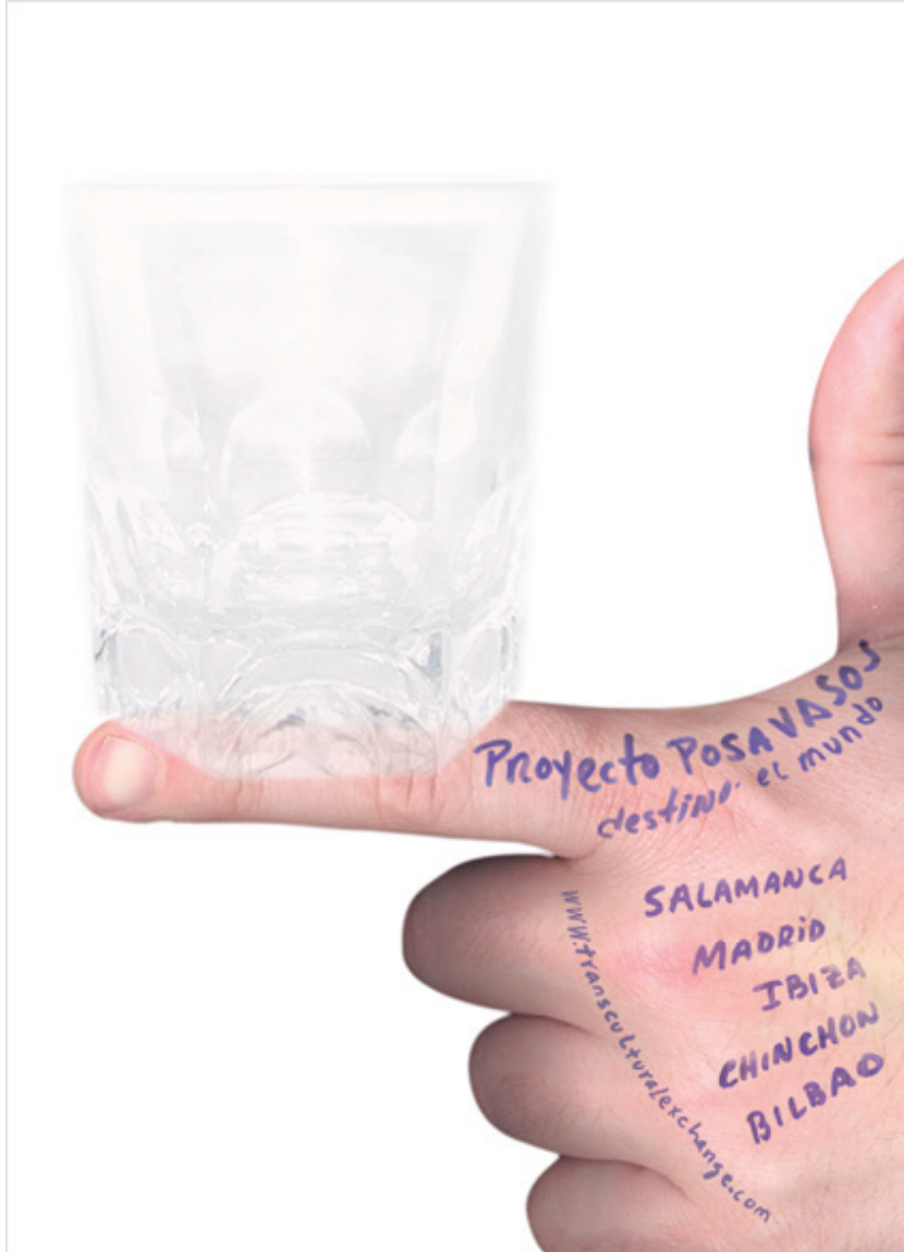
The Coaster Project, Destination: The World Poster (Spain)